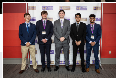
Epsilonian delegation at the 180th Chi Psi National Convention.