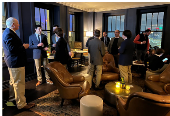
Undergraduates and alumni mixing at a February Re-Founding Class event at the Monarch Club in Detroit.